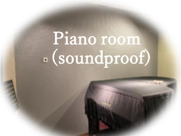
Piano room (soundproof)